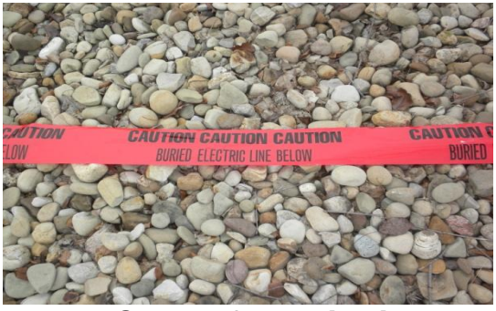
Call Before Digging

Stop digging immediately if you find the red tape pictured below or yellow tape or if you encounter concrete.