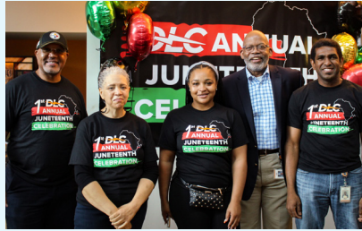
Juneteenth volunteer event with DLC's African-American/Black Business Employee Resource Group, BRIDGE, and Grounded Strategies