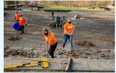
Arbor Day and Earth Month volunteer events with Pittsburgh Parks Conservancy, City of Pittsburgh Department of Forestry, Repair the World: Pittsburgh and Friends of the Riverfront