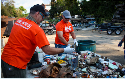
Annual River and Trail Clean-Up with Allegheny Cleanways and Friends of the Riverfront

Employees volunteered more than 3,200 hours in 2021