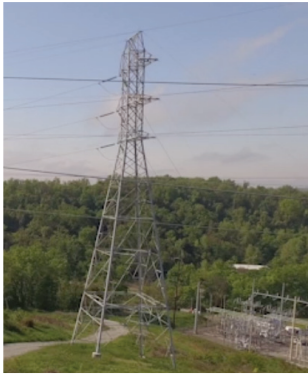
Existing Lattice Tower Structure

Average height is 93 feet Average base is 20 to 30 feet